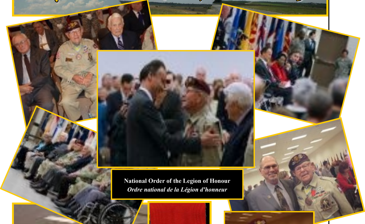
National Order of the Legion of Honour Ordre national de la Légion d'honneur