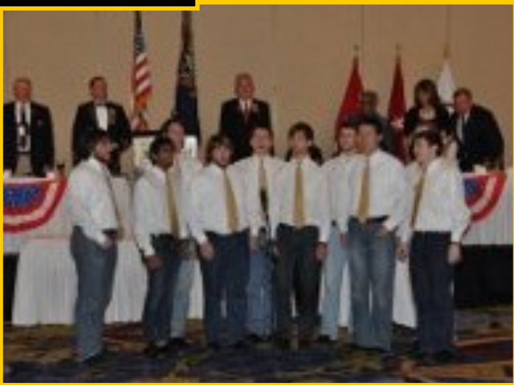
The Rambling Wrecks from Georgia Tech Glee Club provided lots of Good tunes!