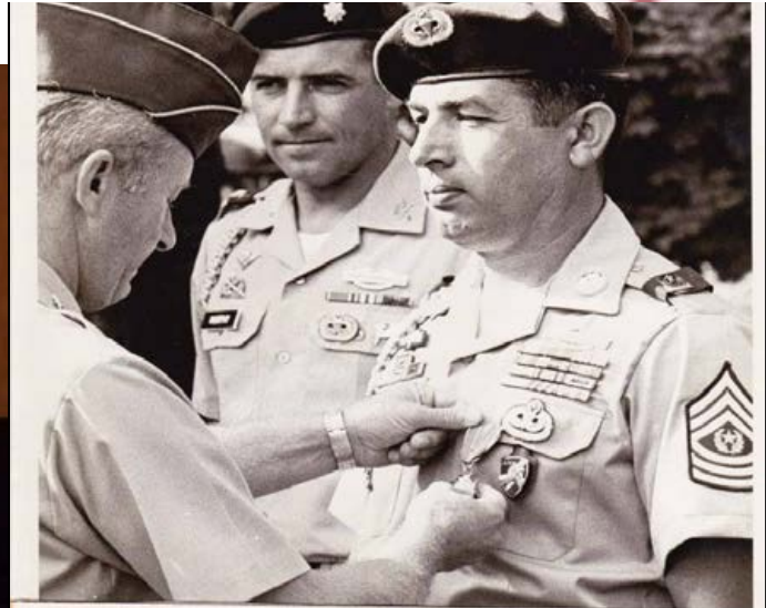
1 OCT 77 VICENZA, ITALY