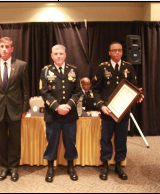
Receives the DMoR award at ceremony at Ft. Polk.

17, 1-509 th IN and a Distinguished Regiment induction The events were to accomplishments of continuing the regiment.