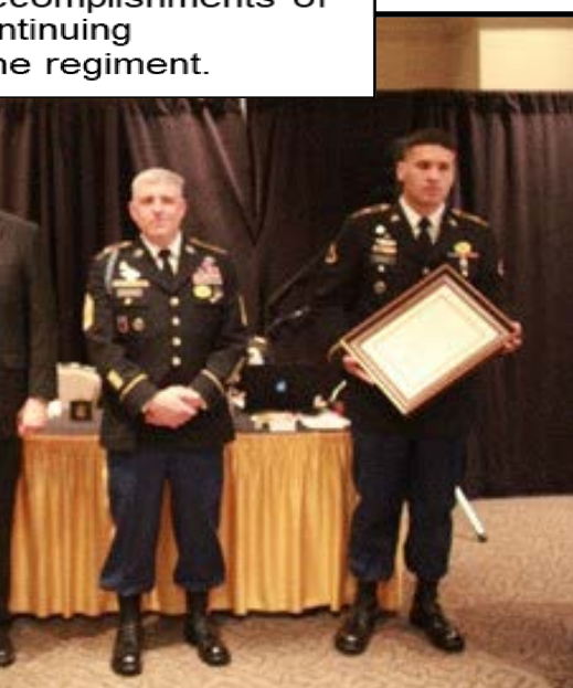
Receives the DMoR award at ceremony at Ft. Polk.

17, 1-509 th IN and a Distinguished Regiment induction The events were to accomplishments of continuing the regiment.